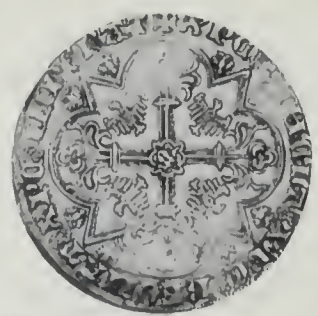
Lot No. 3306

3306 HOLLAND. Willem V, 1350-1389. Double Mouton d'or. Obv. Lamb with GVL DVX below. Fr.238, Del.721. Very Fine. (1,500-2,000)